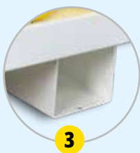
3 Floor fixing