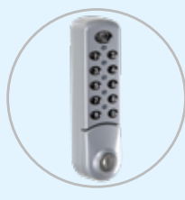
Code lock option SERCODE code lock (1 per door)