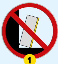
1 Wall mounting kit