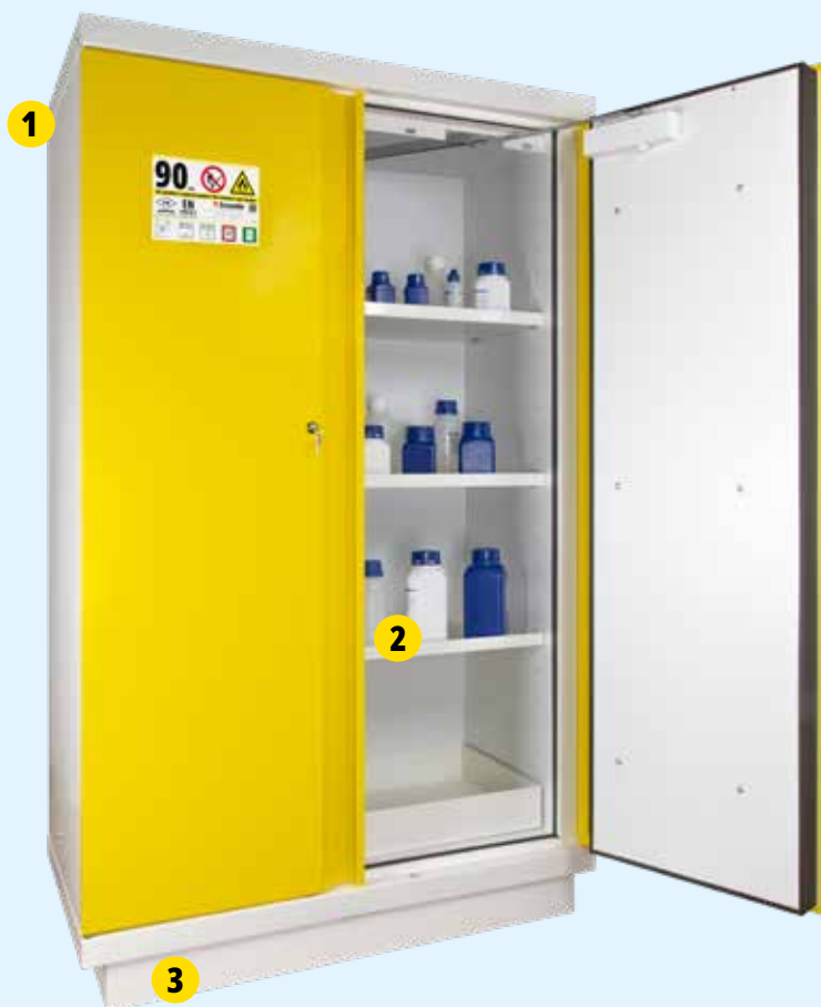
▲ 795+PJBE + C235