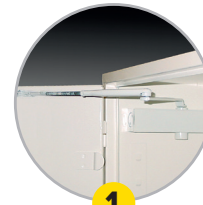
1 Automatic door closing doors (depending on model)