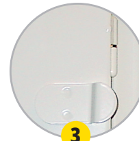
3 Hinges reinforced