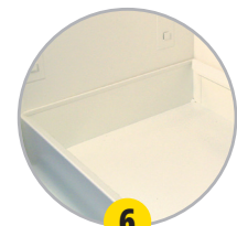
6 Removable containment sump (depending on model)