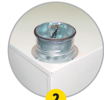
2 Ventilation outlet with fire damper (depending on model)