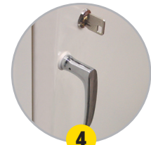
4 Doors with lockable