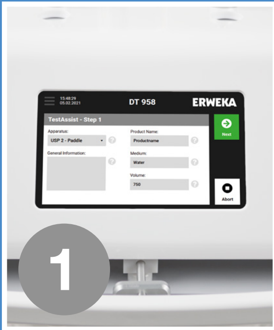
Step 1: Enter method details, such as name, medium and volume of medium.