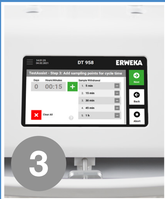
Step 3: Configure cycle times with a simple, yet effective input screen.