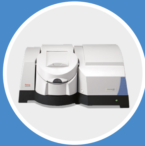
ThermoFischer spectrophotometer for DT Online UV/Vis System