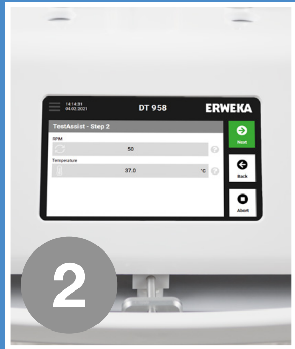
Step 2: Configure RPM and Temperature parameters of your dissolution run.