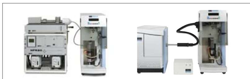
Figure 1. Pyris 1 TGA is shown interfaced to a HPR-20 MS (left) and a Clarus 600 MS (right).

All of the TGA systems supplied by PerkinElmer (Pyris™ 1 TGA, STA 6000 and TGA 4000) can be easily interfaced to MS systems. PerkinElmer can supply systems with either the PerkinElmer Clarus® MS or with a Hiden Analytical MS. In this study, a Pyris 1 TGA interfaced to a Hiden Analytical HPR-20 MS was used.